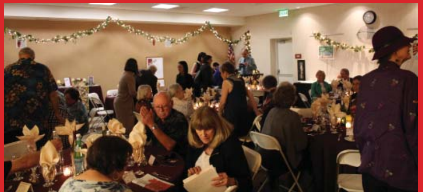
Cooking with Wine Dinner