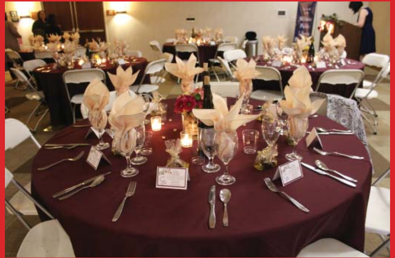
Table Decor, Cooking with Wine Dinner